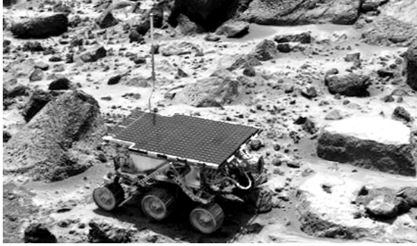
Sojourner, the Mars rover, near the Rock Garden on Mars.

reforms came in 1997 when Pathfinder reached Mars and its tiny Sojourner robot separated to inch along the surface. The mission cost a fraction of the expense of previous Mars probes.