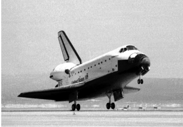
Space Shuttle Endeavour landing at Edwards.

The restructuring strategy had at least four major dimensions: “back to basics,” privatizing, decentralizing, and downsizing. While these aspects related to one another, there were differences. “Back to basics” meant focusing on the primary business of NASA, which was research and development (R&D), not operations. The latter was the job of the private sector or other non-R&D agencies. This view led to consideration of what functions NASA could let go and to whom. In February, Goldin commissioned a study that recommended “privatizing” the Shuttle, by which was meant turning over much of the routine work NASA civil servants did to a private contractor. 35 Such action was projected to save program money through efficiencies business could introduce. In November, NASA announced it would negotiate a sole-source contract with United Space Alliance, a partnership of the Lockheed Martin and Rockwell corporations specifically formed for Shuttle “operations.” 36