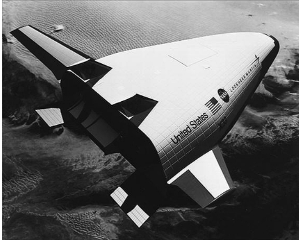
X-33, Reusable Launch Vehicle in simulated flight.