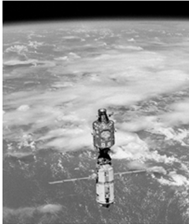
Backdropped against white clouds, the International Space Station moves away from the Space Shuttle Discovery.

The United States and Russia had been talking about joint ventures in space since the Cold War ended in the early 1990s. Under Bush, Goldin had gone to Russia to discuss technical options. In the Clinton administration, Russia proposed, in a way more serious than previously, a partnership involving the Space Station. Goldin and Clinton saw the Space Station as a symbol of the new relationship with Russia. But Clinton wanted Russia to agree not to sell certain missile technology to India in order to stem possible proliferation. The two policy interests collided, and while the Space Station debate took place within Congress, the Clinton administration sought a compromise with the Russians. Goldin was a strong proponent of a Space Station