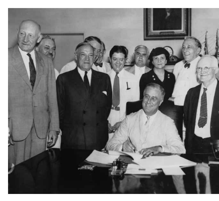
On August 14, 1935, President Roosevelt signs the Social Security \operatorname{Act} in the Cabinet Room of the White House.

Today, about 1% of our cases (and growing more rapidly) are compassion allowances. About 5% are QDD cases. It was largely my back-of-the-envelope estimate with our 2008 plan that we could do 6% to 9% of our cases that way. It looks like we're going to hit the upper end of that range. We are